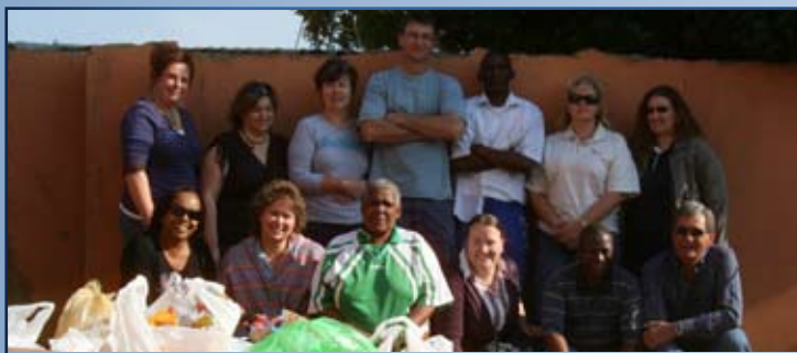
The Indwe Risk Services Team