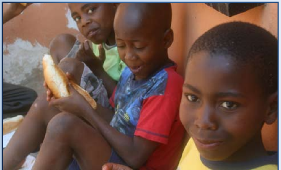
The boys enjoying their hot dogs